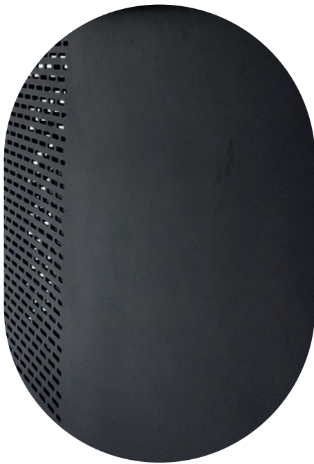
Grey Aluminum Surround