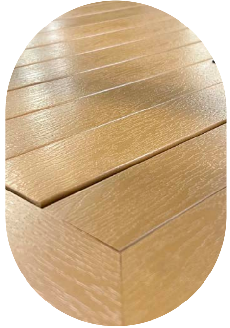
Synthetic Teak Top