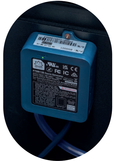
Ozone and Filtration systems